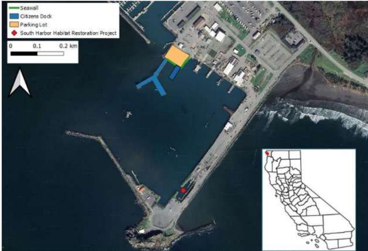
Figure 1. Project Location (Citizens Dock, seawall and parking lot and proposed South Crescent City Harbor Habitat Restoration Project).