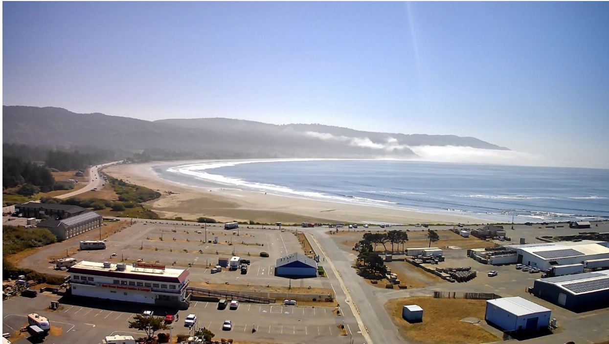
(Redwood Harbor Village photo 2)