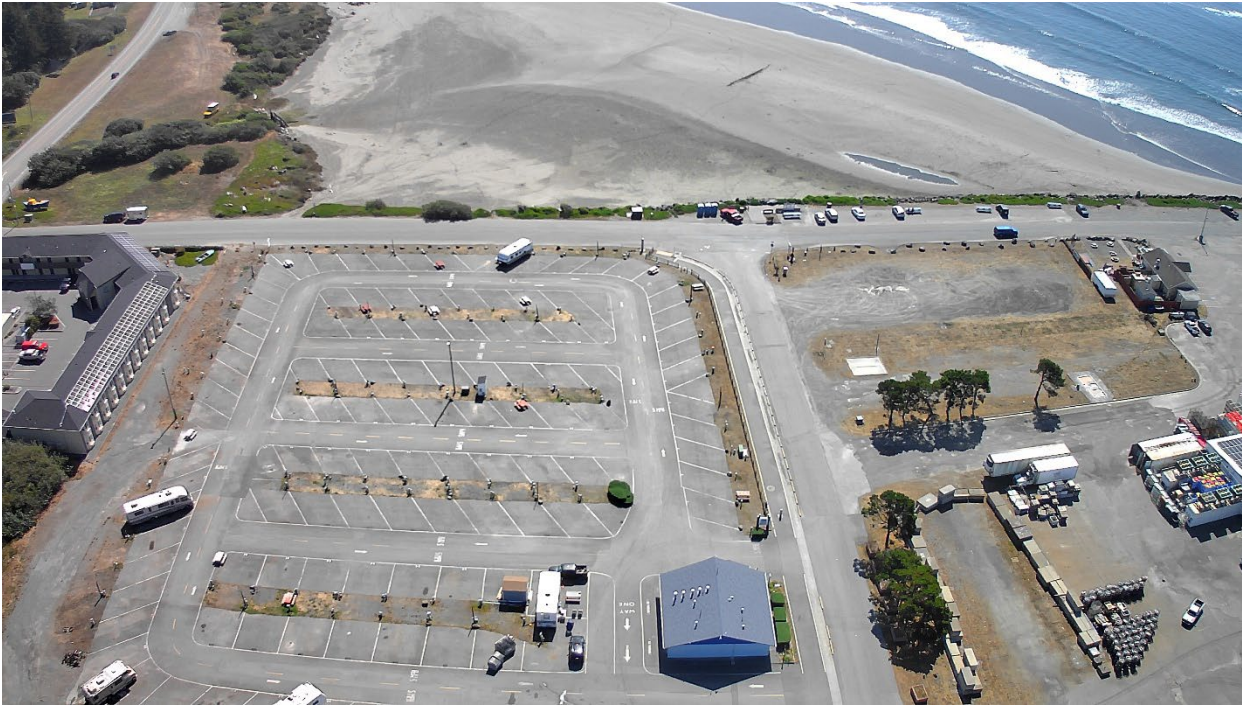
(Redwood Harbor Village photo 1)