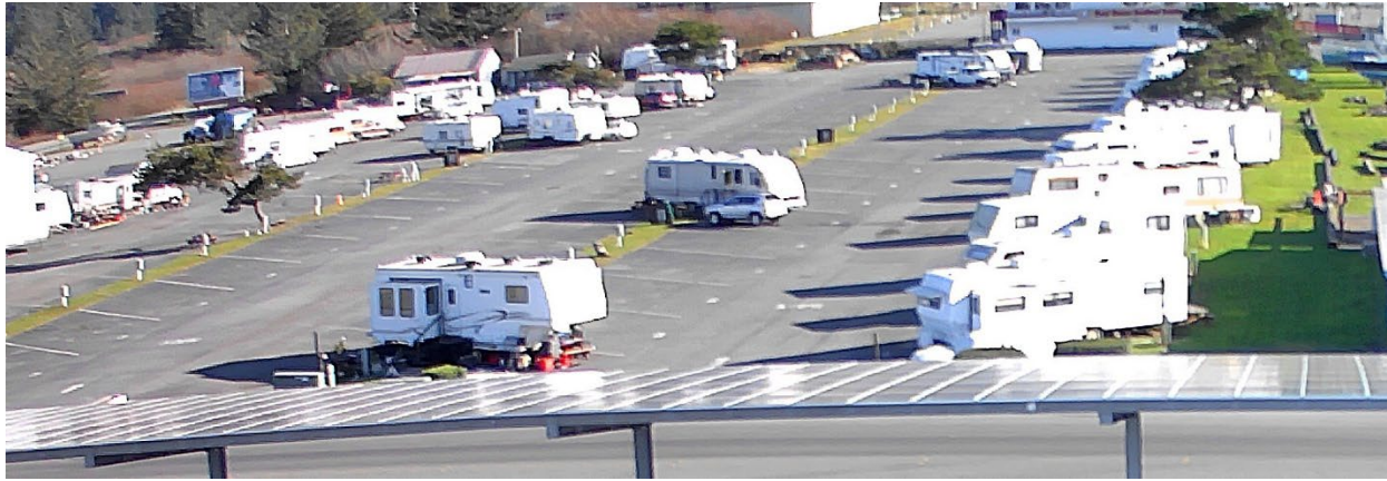
(Bayside RV Park photo 2)