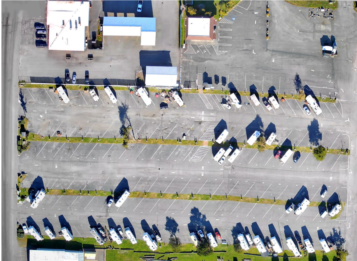
(Bayside RV Park photo 1)